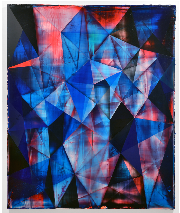
SHANNON FINLEY Halcyon Remembrance , 2012 acrylic on canvas, 70 x 56 x 2.5 inches

Caroline Rowley C24 Gallery T: +1 (646) 416 6300 caroline@c24gallery.com