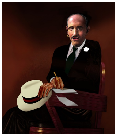
Alfred Leslie Gustav Von Aschenback 2012-2013

OPENING RECEPTION: TUESDAY, MAY 7, 2013, 6 - 8PM