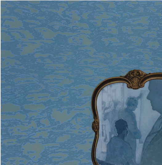
Reflex , 2016, oil on canvas, 57 x 57in (144.8 x 144.8 cm)