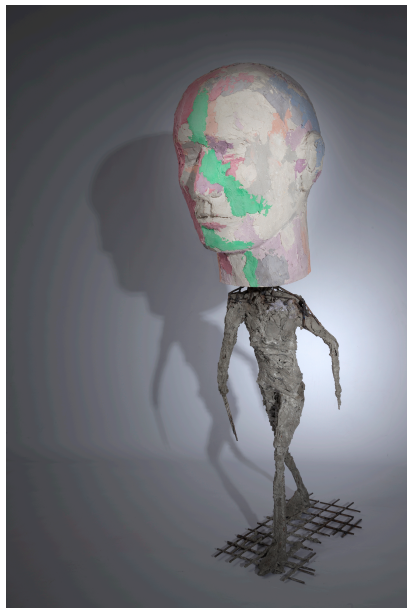
İrfan Önürmen, Bust-Head , 2018 Colored concrete 51.18 x 13.78 x 17.72 inches (130 x 35 x 45 cm)