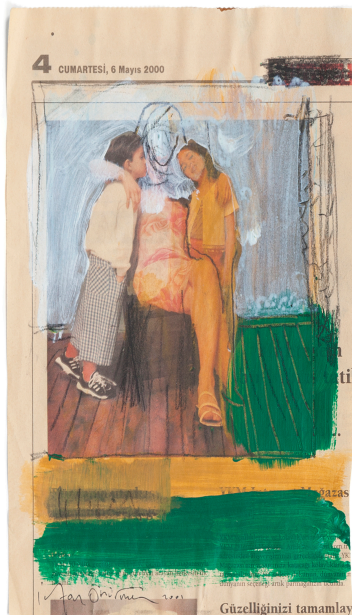
İrfan Önürmen, Newspaper Series 6 , 2000 Mixed media on newspaper 10.63 x 7.09 inches (27 x 18 cm)