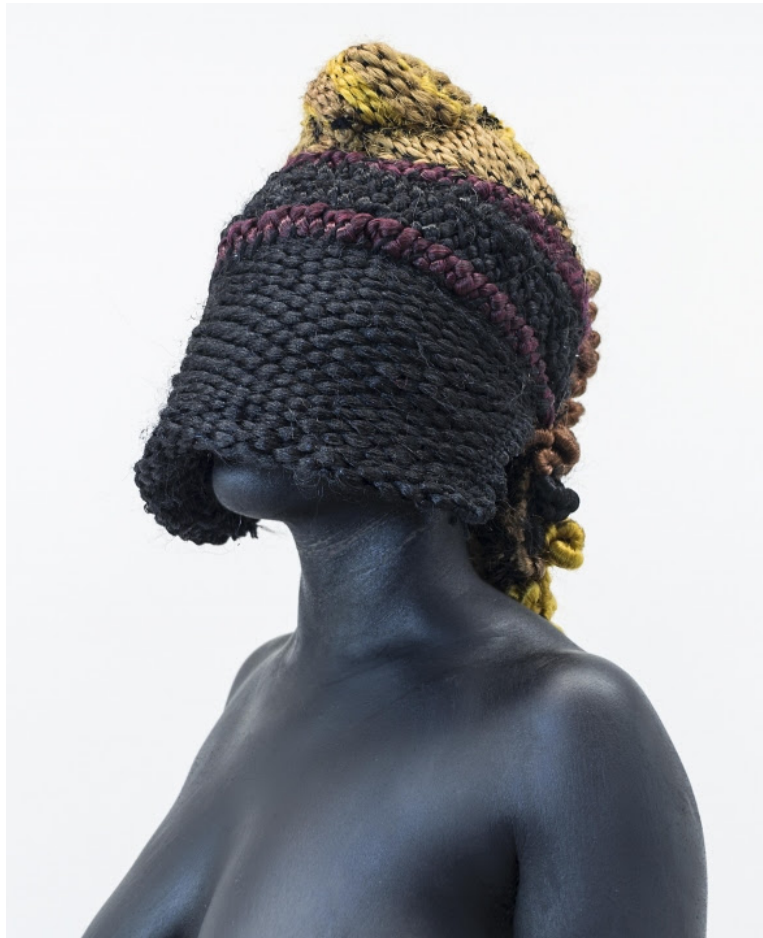
Stephanie J. Woods, Weave Idolatry II , 2015, Photograph (hand woven synthetic hair weave, black body paint) with salvaged antique gold frame, 28.5" X 23.5", Edition 1 of 2

including images of women gazing into mirrors and Dargas' favored subject of flowing honey and chocolate over female faces. His provocative, hyper-realistic style together with his meticulous attention to detail create a sense of immediacy that is textured and visceral. But a deeper look at his work reveals a fascination with intimacy, a kind of personal and private experience, conjured by an inflaming of the senses. His paintings, though extremely sensual, go beyond the erotic, towards an exploration of self-awareness and love, and a reinvigoration of innocence, genuine emotion and sacredness.