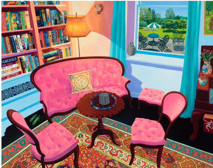
In Reverence , 2023, Acrylic on canvas, 44 x 57 in.

Thursday, March 23 – Thursday, May 11, 2023