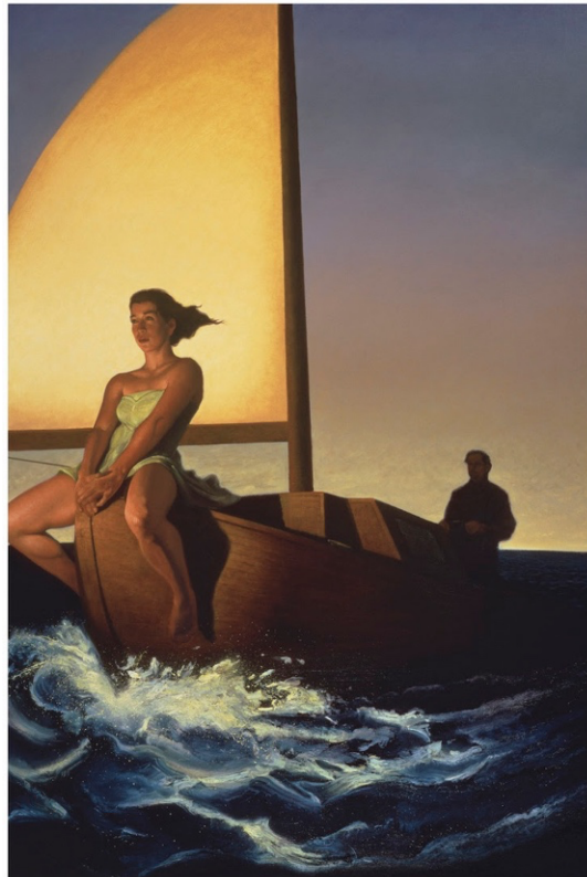
Christian Vincent, Recurring Dream , 2023, Oil on canvas, 20 x 16in. (50.8 x 40.6cm) and 60 x 42in. (152.4 x 106.7cm), Editions of 250