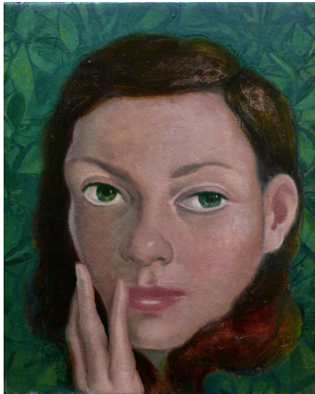
Christian Vincent, Green Ivy , 2023, Oil on canvas, 20 x 16in. (50.8 x 40.6cm)