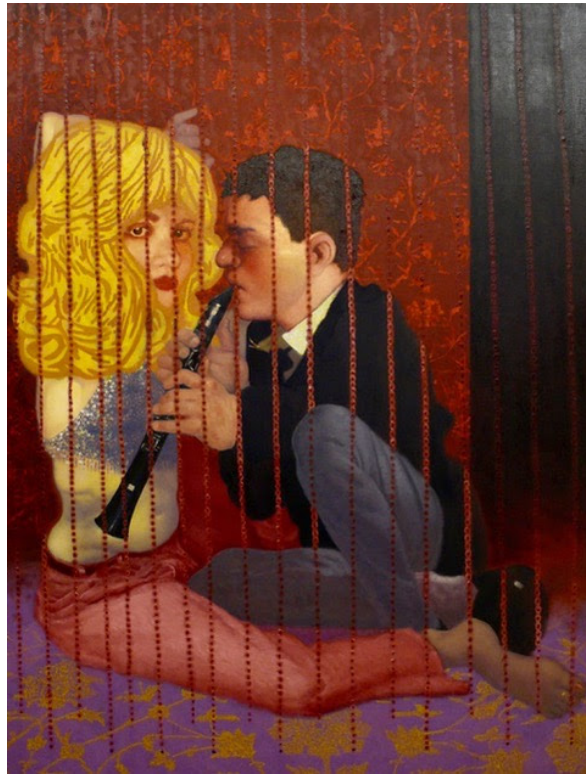
Christian Vincent, The Lesson , 2023, Oil on canvas, 72 x 54in. (182.9 x 137.2cm)