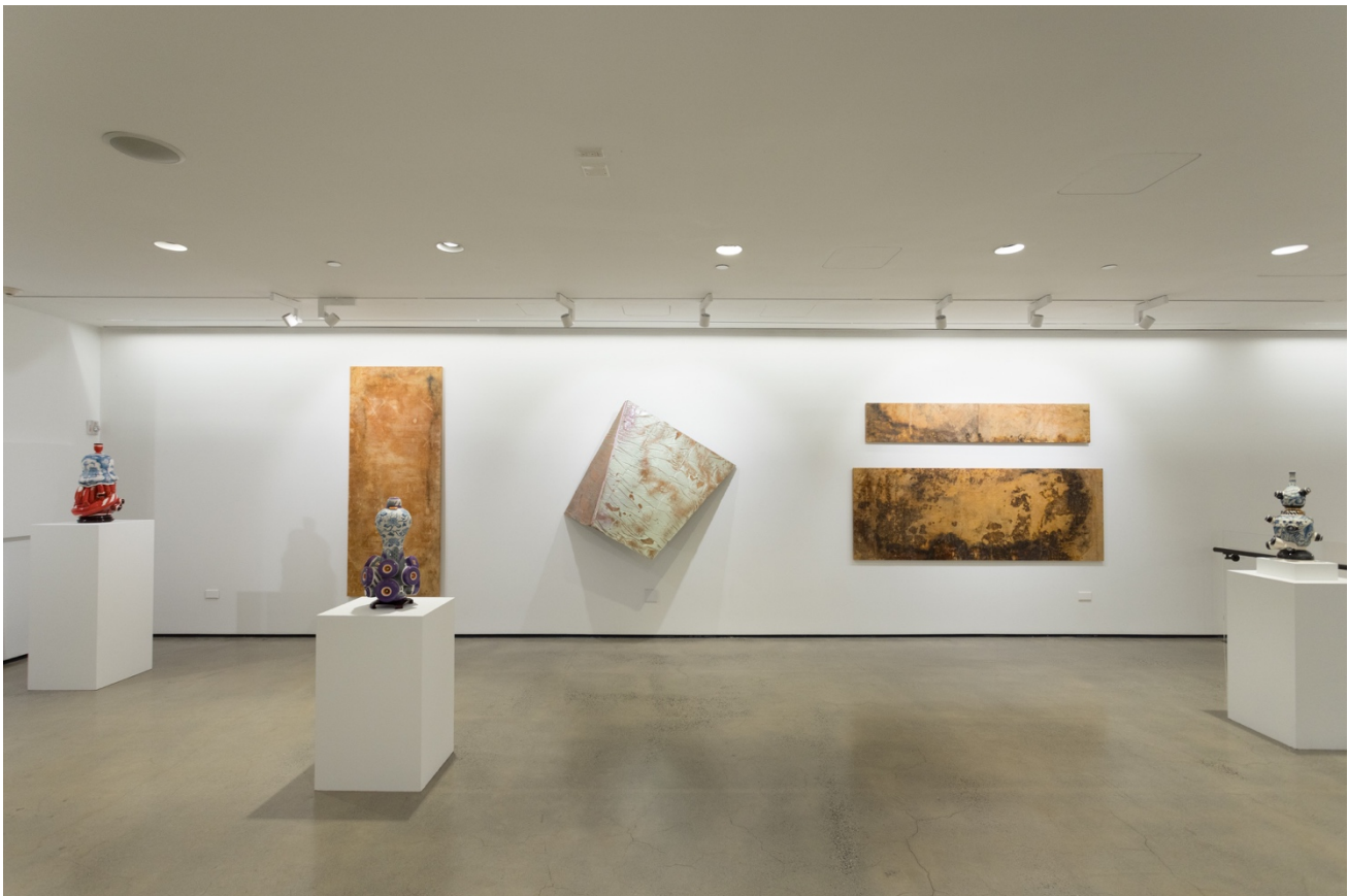
Installation view of Coby Kennedy's exhibition at C24 Gallery.