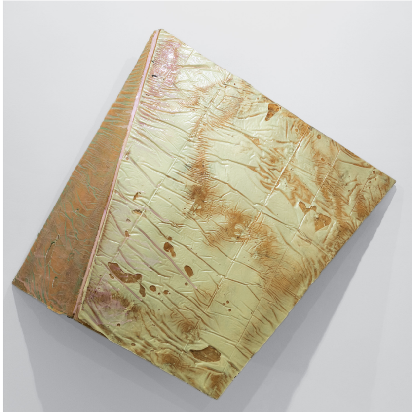
Coby Kennedy's Untitled (2023)

“A futurist, Coby has an unyielding commitment to confronting the pressing concerns of our era, creating a captivating tapestry, weaving across the boundaries of time and space”