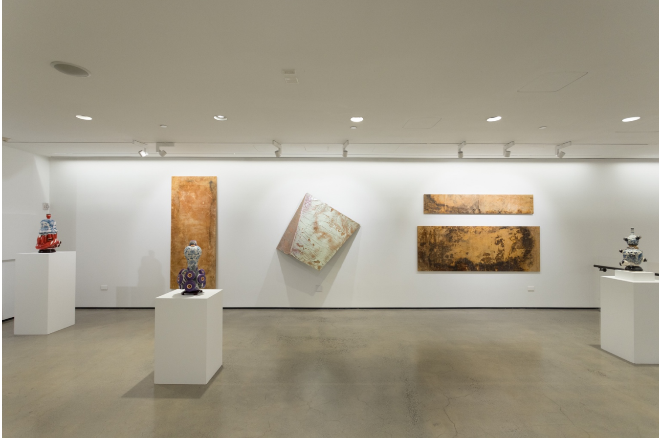
Installation view of Coby Kennedy's exhibition at C24 Gallery PHOTO: COURTESY OF C24 GALLERY

https://galeriemagazine.com/next-big-thing-coby-kennedy/