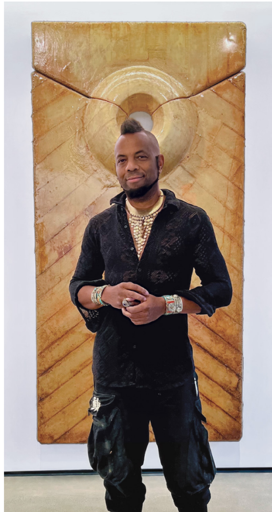
The artist in front of a 2023 work.

Utilizing stretched and mounted bulletproof Kevlar, oxidized rust, and tinted resin, Coby Kennedy surveys centuries of perseverance in Black America with a unique, visceral language. “I found it to be more efficient to tell huge parts of the story through the materials themselves,” says Kennedy, whose new works are on view at C24 Gallery in New York through December 23.