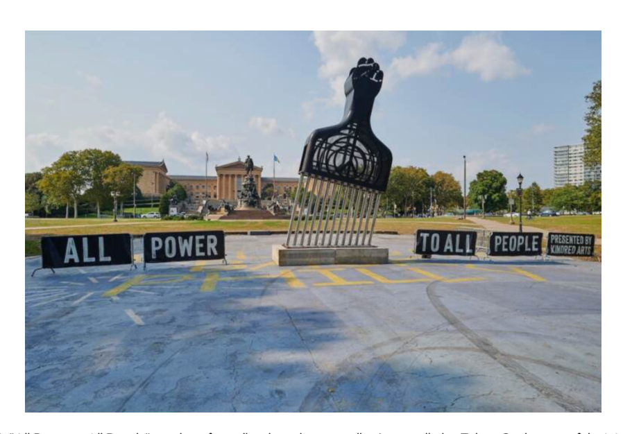
Hank Willis Thomas's "All Power to All People" stands 28 feet tall and weighs 24,000lbs. It is installed in Eakins Oval as part of the Monumental Tour, made up of four large sculptures installed in celebrated public places.

A touring exhibition designed to challenge colonial ideas of power, community, and incarceration has landed in Philadelphia, bringing four art pieces to some of the city's most prominent public spaces.