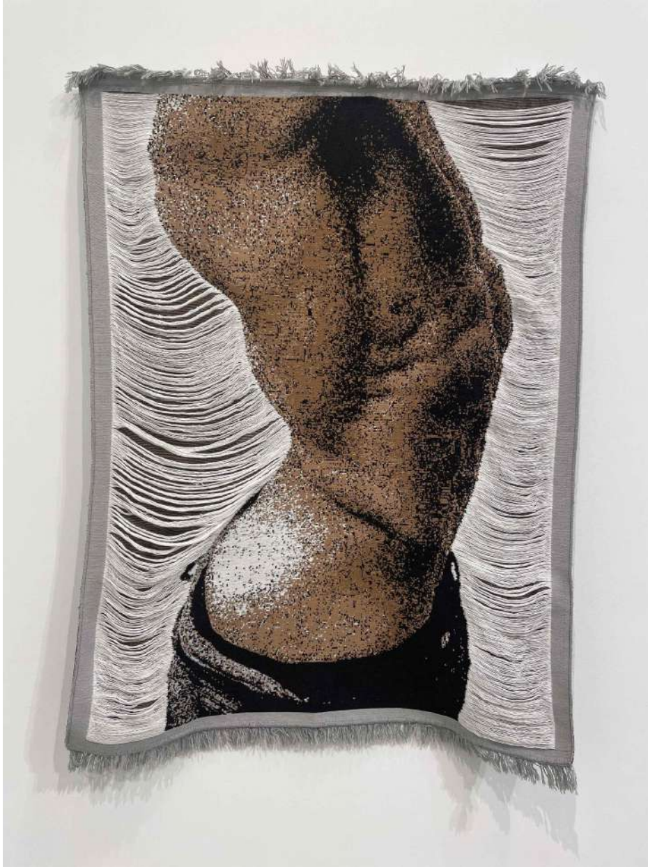
Fırat Neziroğlu Adonis , 2019 Weaving, recycled yarn, wool, cotton, kilim 60.63 x 44.88in. (154 x 114cm) (Inventory# FN5774) $18,000