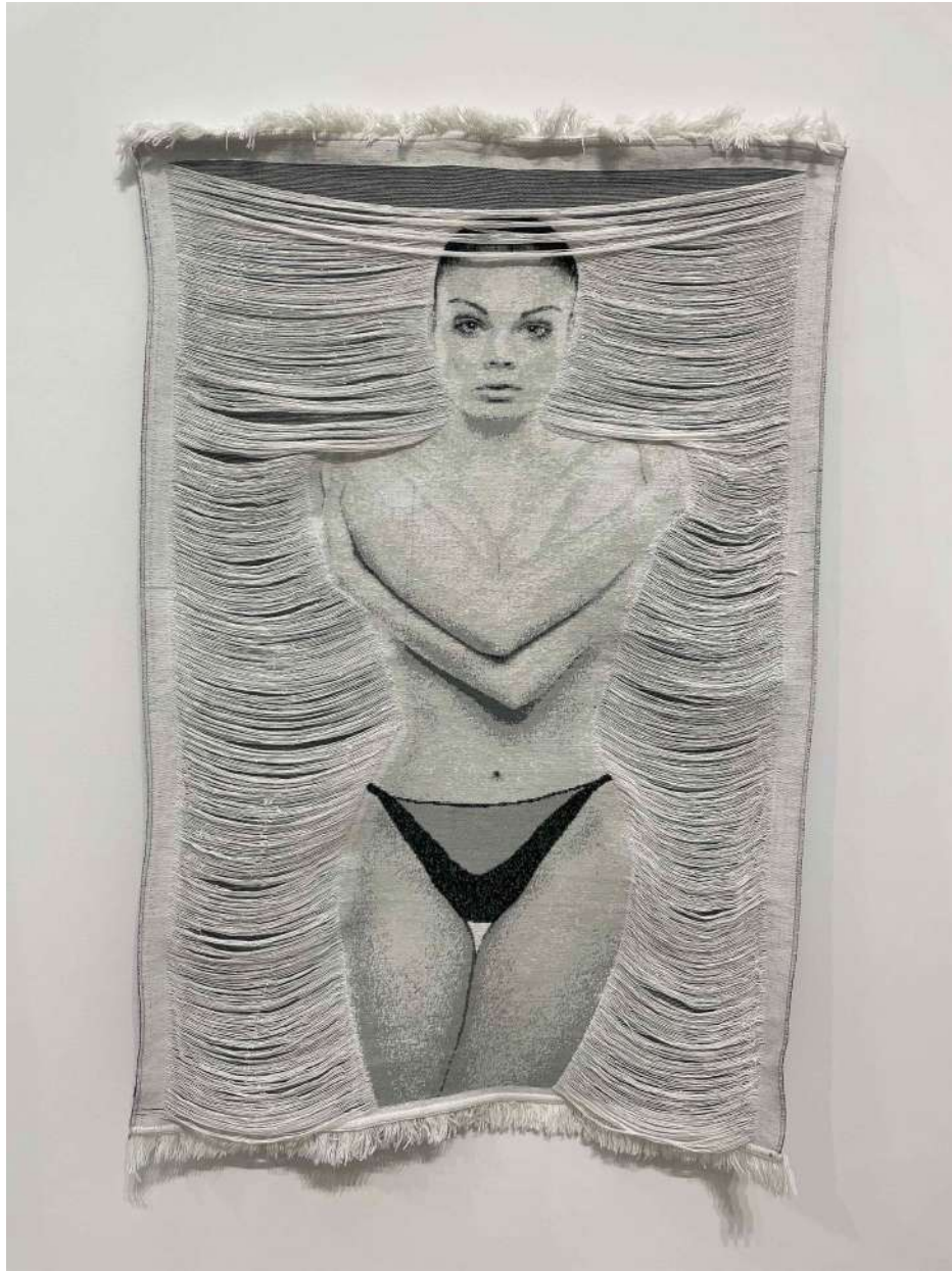
Fırat Neziroğlu Aphrodite , 2019 Weaving, recycled yarn, wool, cotton, kilim 68 x 45in. (172.7 x 114.3cm) (Inventory# FN5772) $18,000