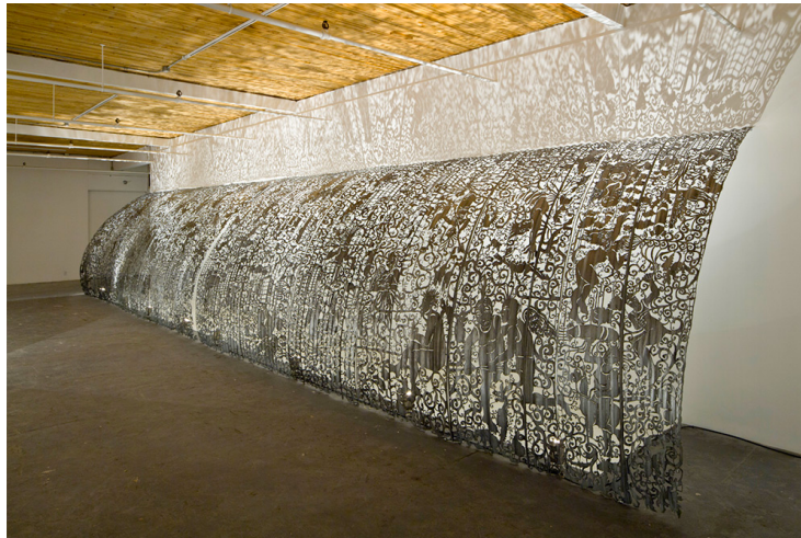
Gutter Snipes, 2011

Cal Lane works in a series of “Industrial Doilies”, producing works that use contradiction to create an empathetic form. Lane imparts highly industrial materials with touches of delicacy, adding filigree to car parts, oil tanks, and shovels with a blowtorch. Her chosen patterns also exist on another level, their compositions inspired by those used in religious ceremonies such as weddings, christenings, and funerals.