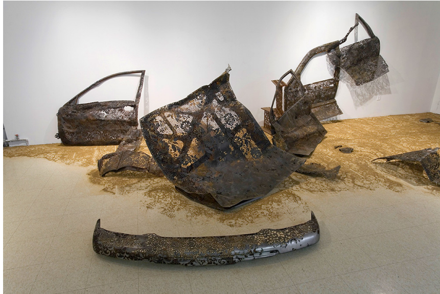
Car Bombing, 2007