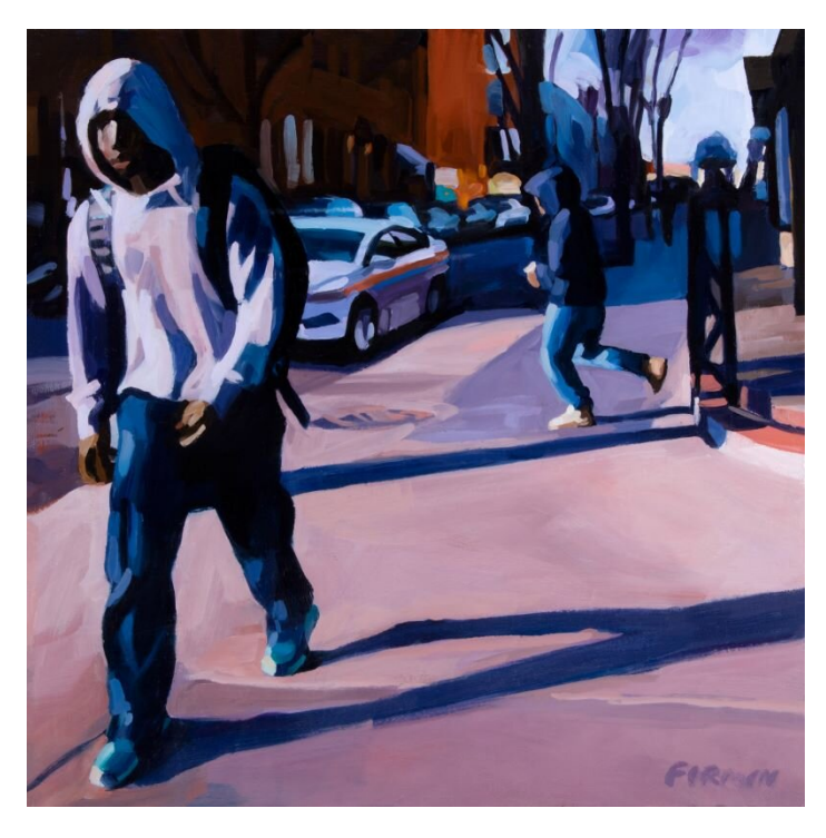
"Man in a Hoodie", 2017 - Oil on wood panel, Framed Dimensions: 21.26 x 21.26 in. (54 x 54 cm)

I moved upstate in 2000, and painted my urban landscapes for several years, while living up here and going back to the city to get material. My career was in full throttle at this point; I had two galleries, one in Provincetown (which I still have) and one in Santa Fe. I was producing around twenty-five paintings a year, not including the monoprints, and selling almost everything I painted. Gradually though, since I wasn't painting what I was seeing, the work got a little stale. So in 2007 I started going to figure drawing classes and painting nudes. My galleries didn't want this new work, so I sort of melded those two things together and started painting the figure in the urban landscape, so the figure could take up the whole painting! I love painting the light on the figure. I love painting light — period.