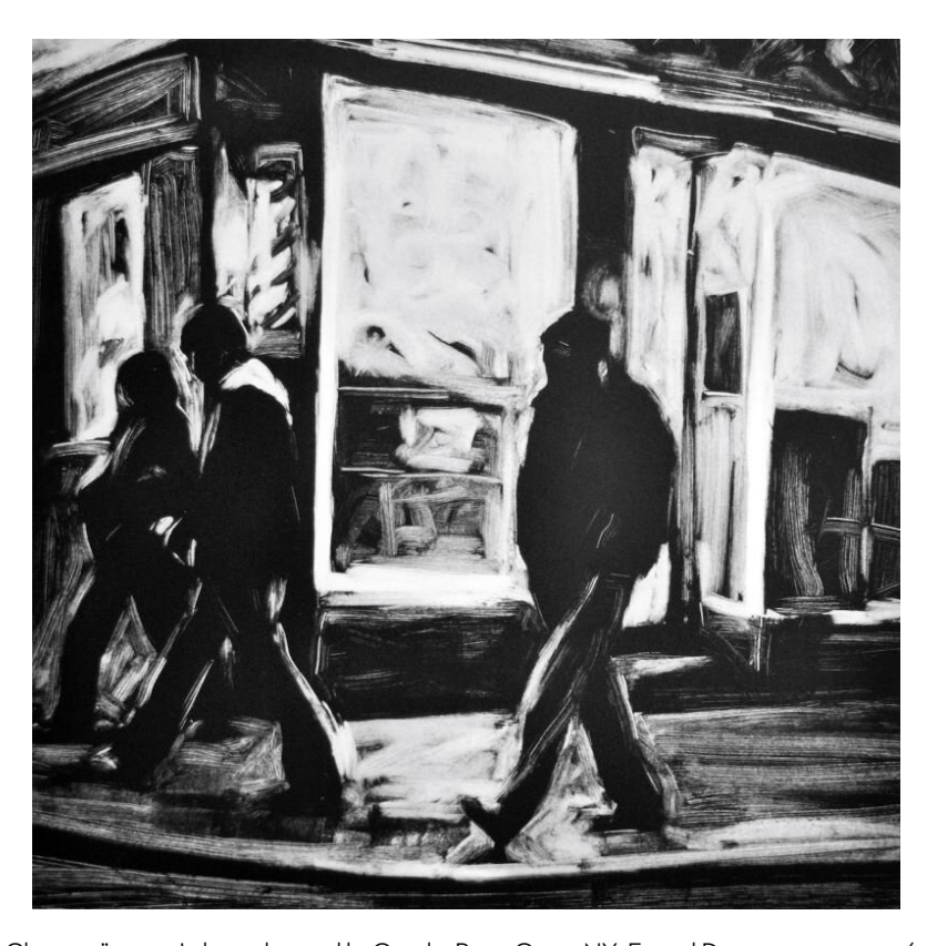
"Barbershop, Chinatown", 2014 - Lithograph printed by Corridor Press, Otego, NY, Framed Dimensions: 27 x 27 in. (68.6 x 68.6 cm)

Your work that is currently being shown as a part of C24 Gallery's group show Street Life includes not only your colorful oil paintings but also black and white lithographs. What appeals to you about contrasting the oil paintings with your monochrome lithographs? In what ways do the two approaches complement and also contrast each other in terms of your thematic approach to depicting urban life?