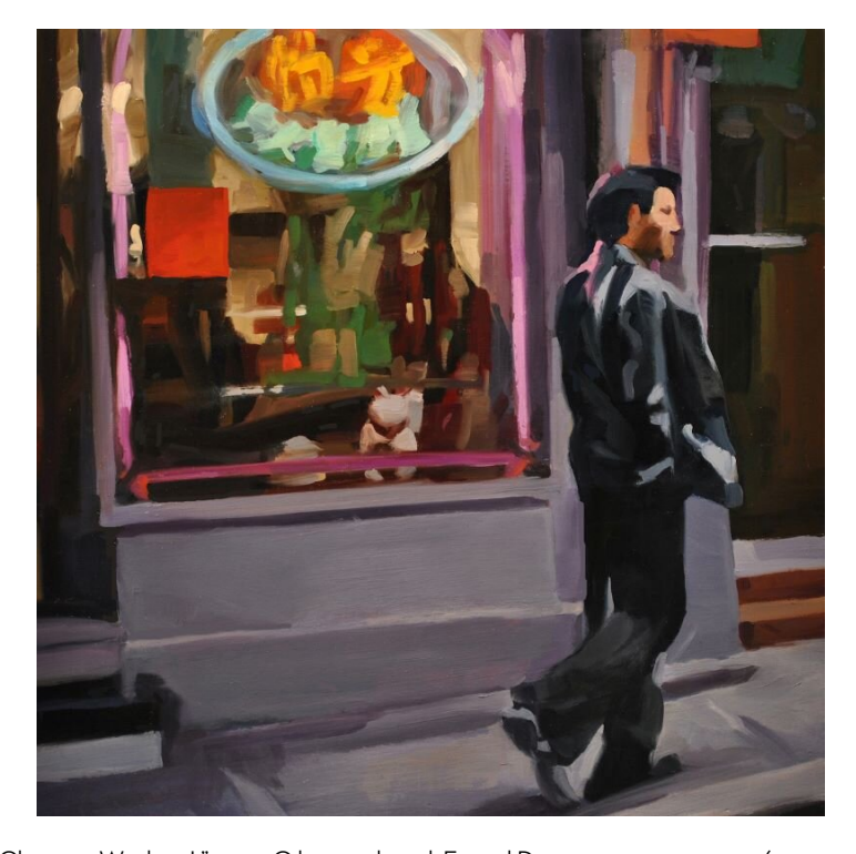
"Chinatown Windows I," 2013 - Oil on wood panel, Framed Dimensions: 17.32 x 17.32in. ( 44 \times 44 cm)

Your urban landscapes follow up on the tradition of such painters as George Bellows and Edward Hopper. What do you think initially attracted you to their style and to their expressive explorations of human solitude?